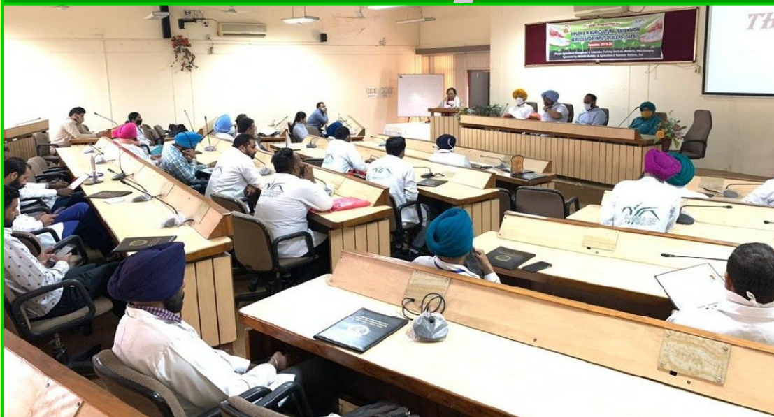
Valedictory Session of Diploma in Agricultural Extension Services for Input Dealers (DAESI) 2 nd Batch